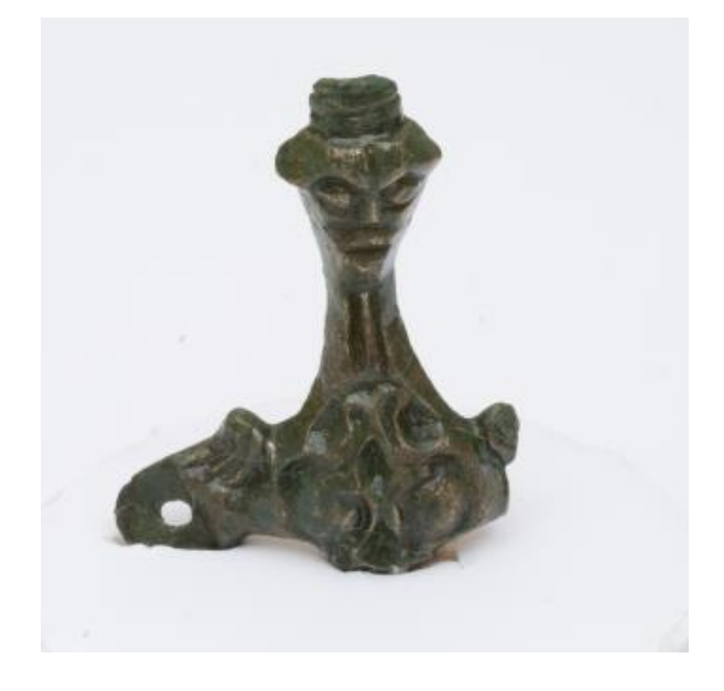
Bronze pendant, Novgorod