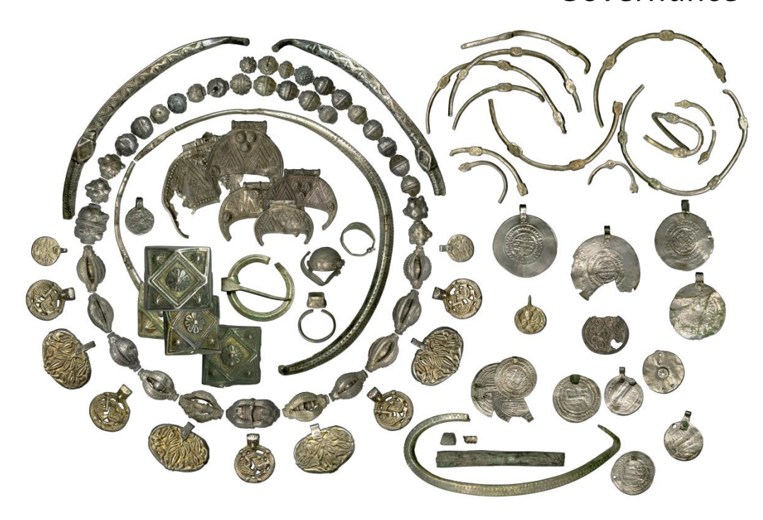
Themes: Trade & Alliances Cultural Meeting Communication Governance