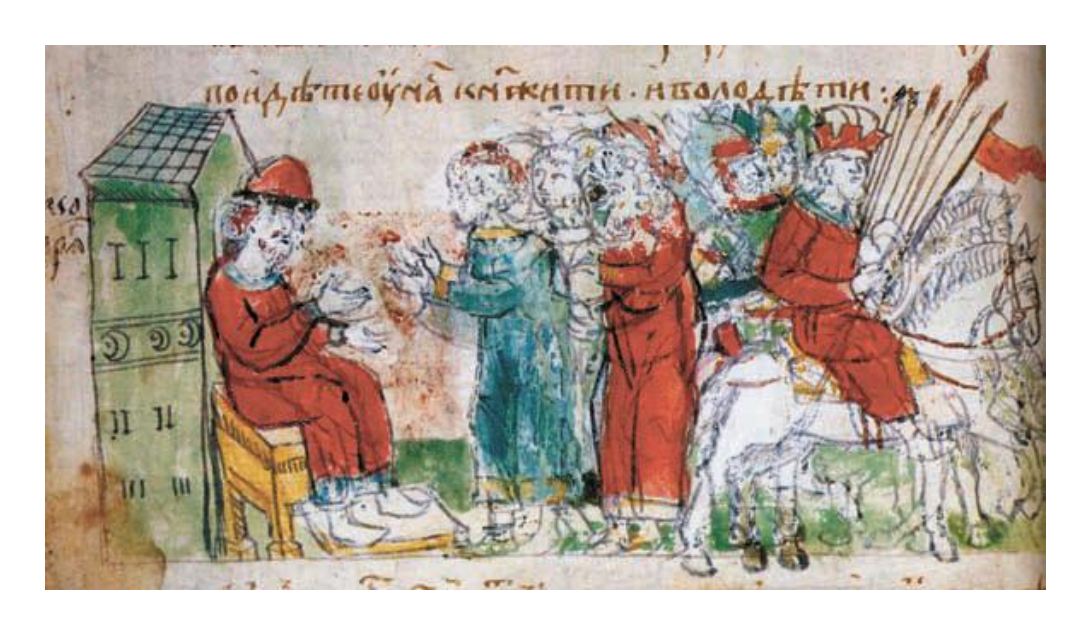
"Calling of the Varangians" (Russian Primary Chronicle)