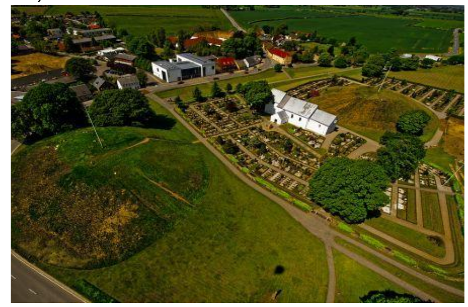
Jelling, nearby Vejle showing showing the cultural heritage area with the two huge gravemounds, runic stones and church visible.