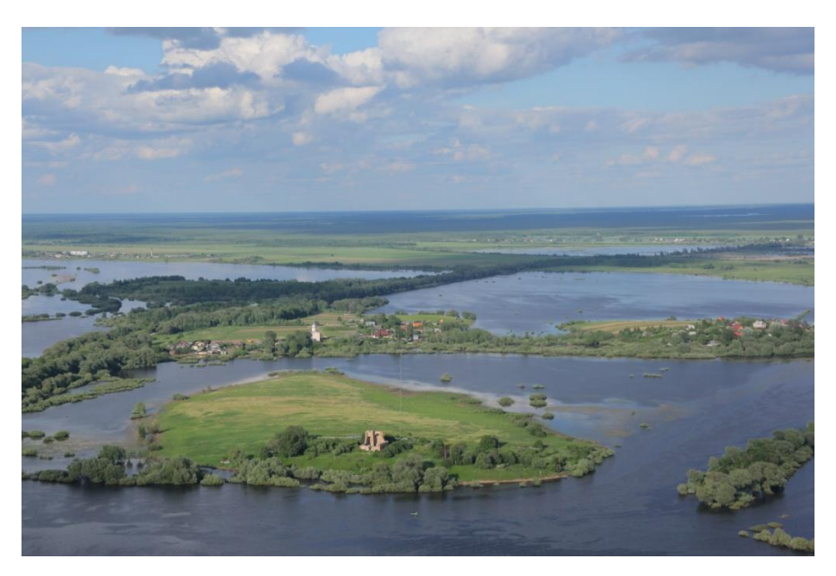
Ruriko Gorodishe - View from the Wolchov river