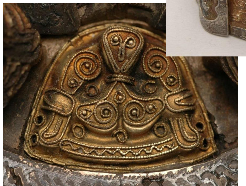
Gold plated brooch, Tingstäde - Gotland