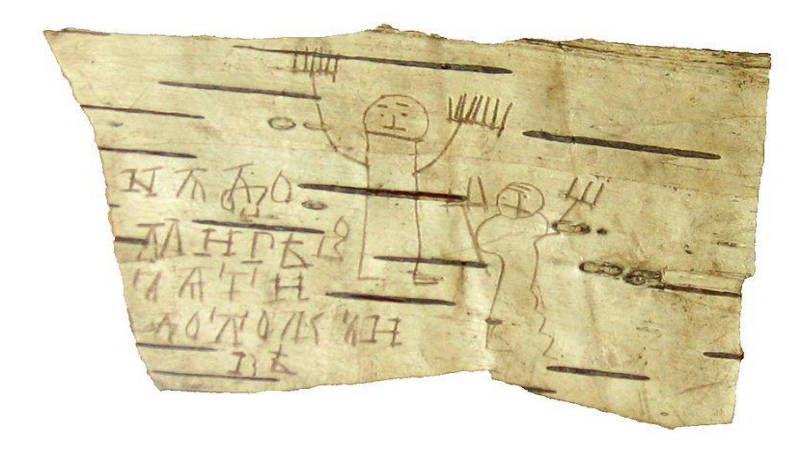
Example of at birch bark letter (nr. 202) found in Novgorod