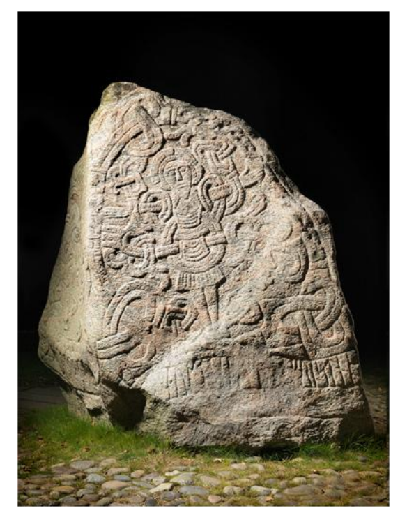
Harald Bluetooths runic stone in Jelling