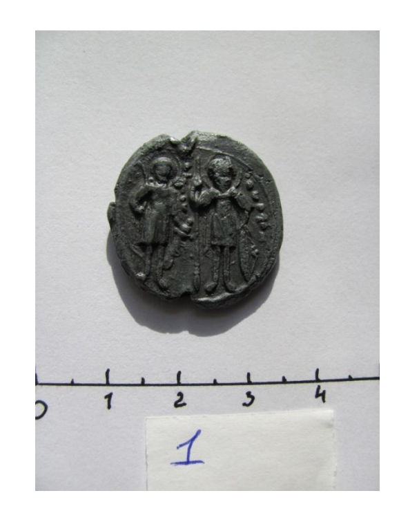
Prince Vsevolod's seal, Novgorod